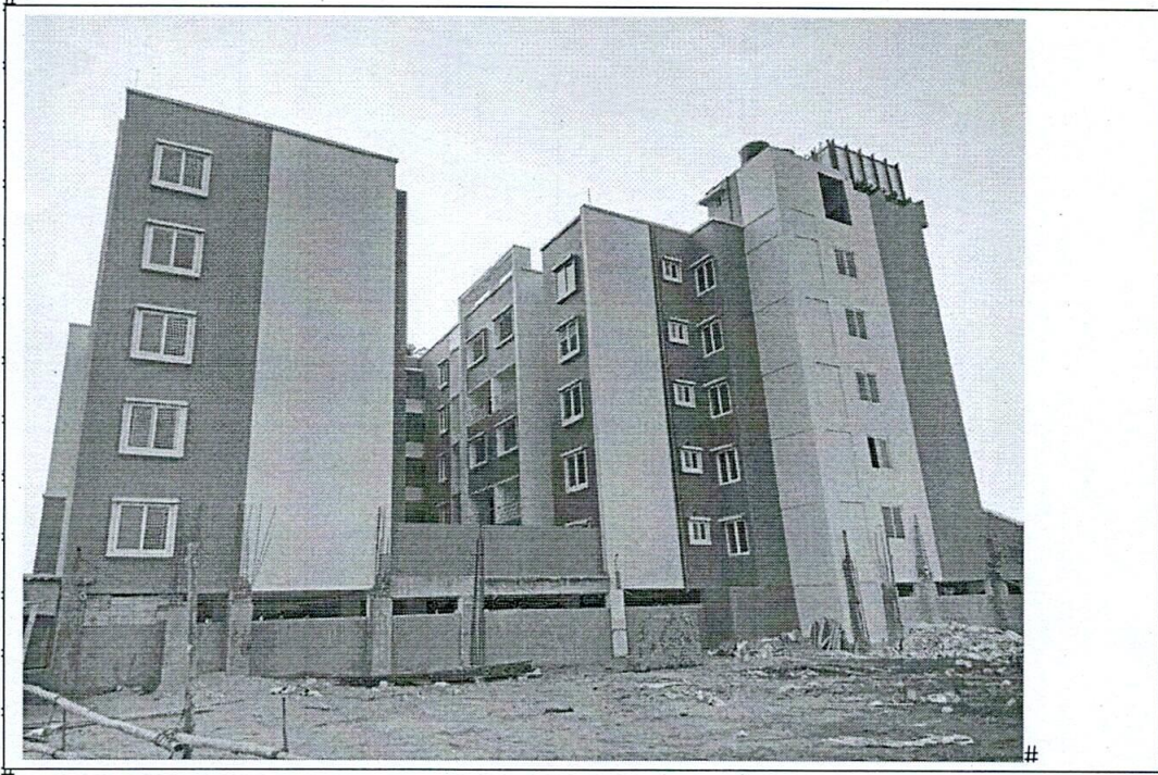
Block A (Part) : Progress 90%