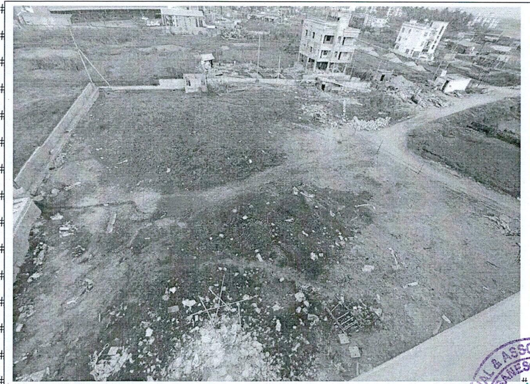
Vacant Plot: Progress 0%#