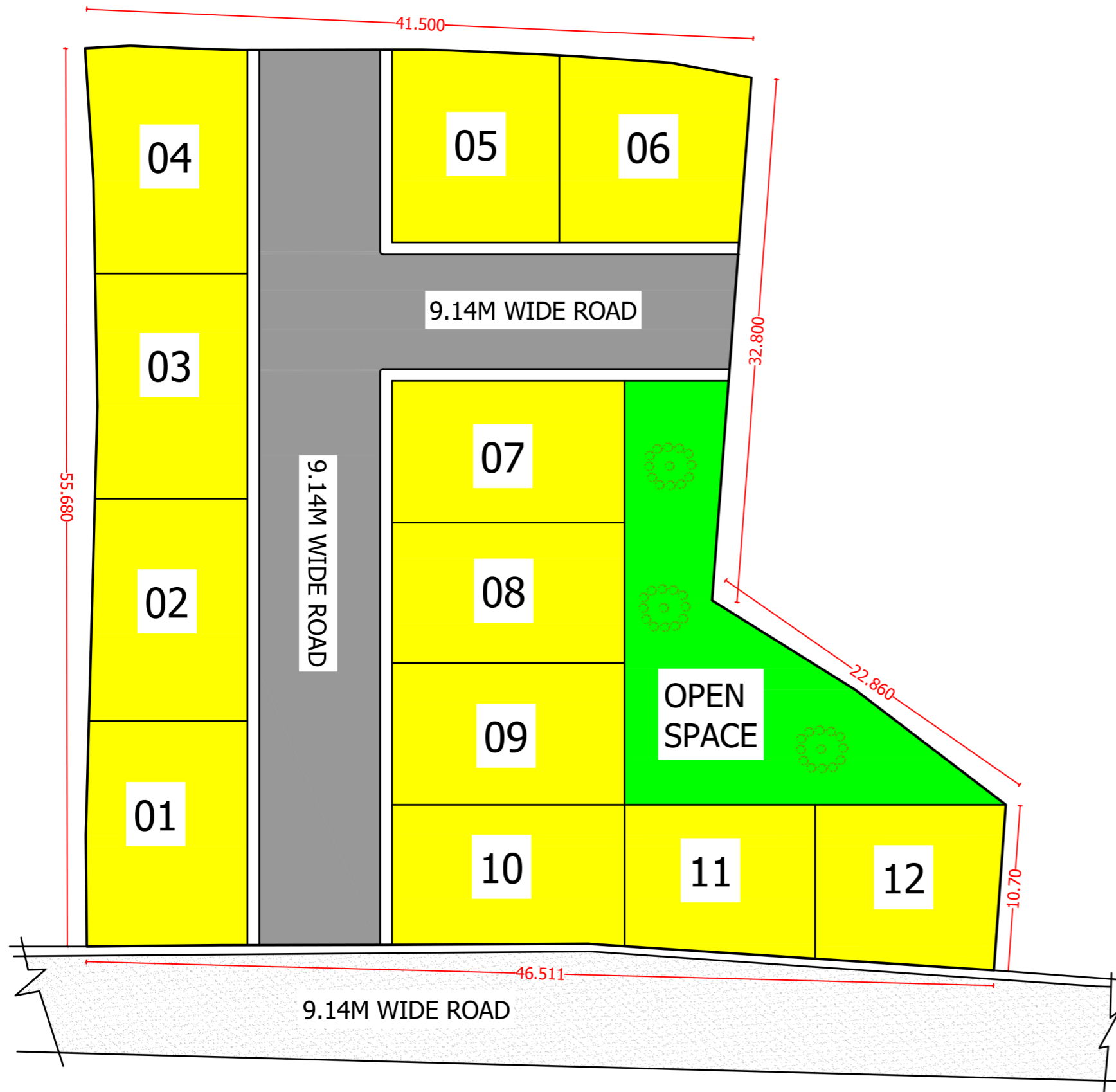
COLOR CODE LAY OUT PLAN