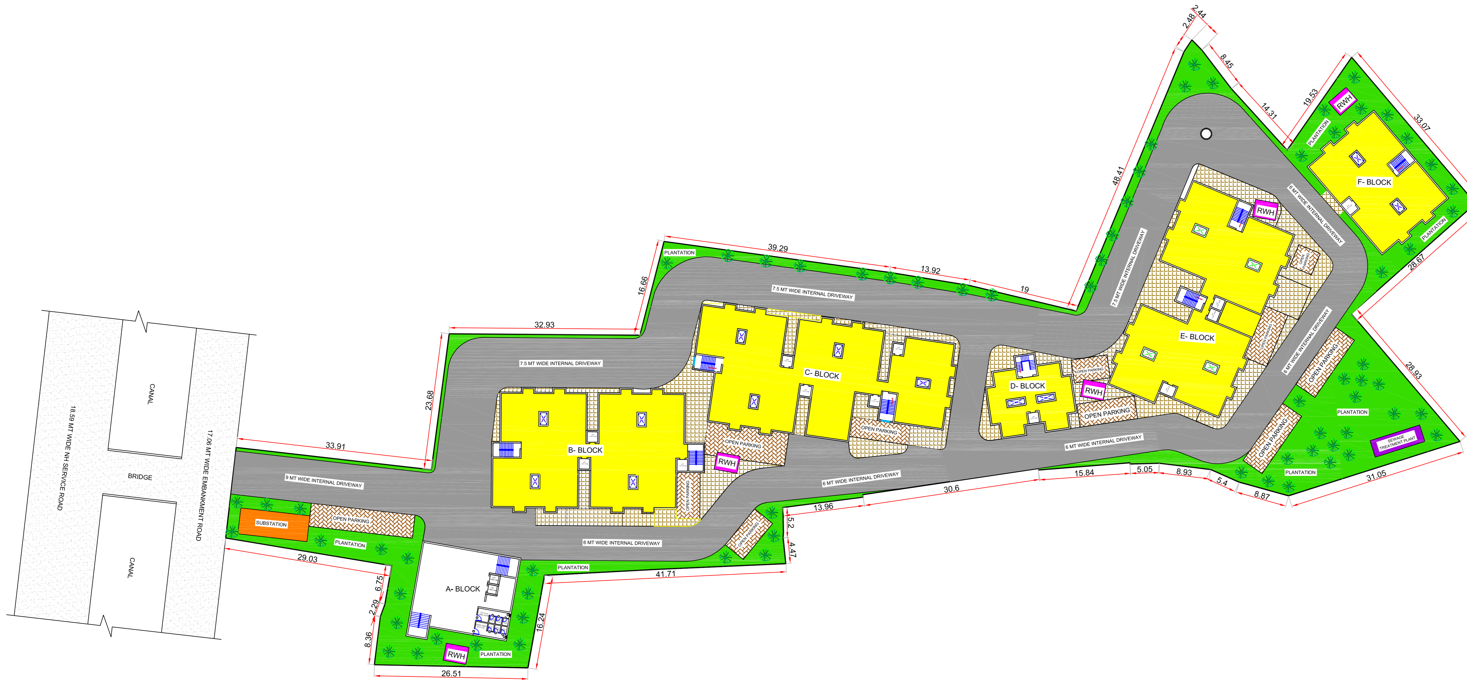
COLOR CODE LAY OUT PLAN SCALE - 1:350