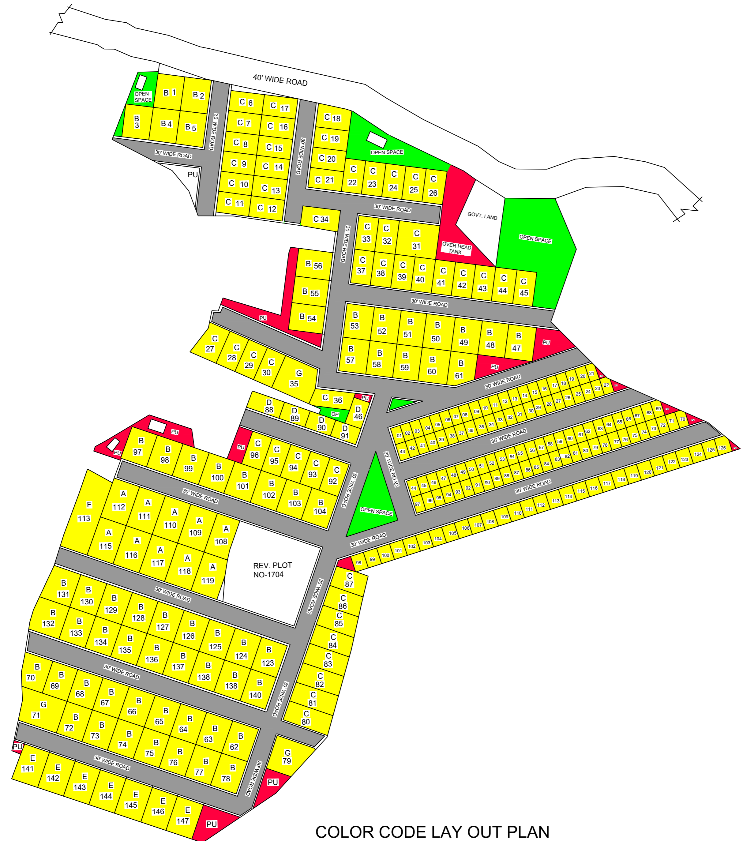
COLOR CODE LAY OUT PLAN

This is to certify that the body of the color layout plan has been prepared as per the Odisha Real Estate Regulatory Authority (ORERA) . The same has been prepared strictly in accordance with the layout plan approved by the competent planning authority.